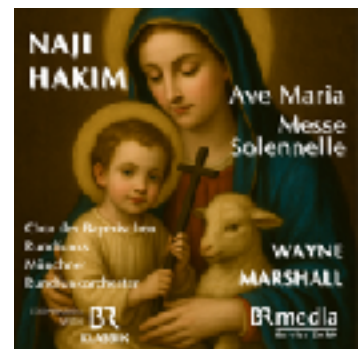
AVE MARIA & MESSE SOLENNELLE